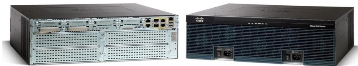
Figure 1. Cisco 3900 Series Integrated Services Routers

Cisco® 3900 Series Integrated Services Routers build on 25 years of Cisco innovation and product leadership. The new Cisco Integrated Services Routers Generation 2 (ISR G2) platforms are architected to enable the next phase of branch-office evolution, providing rich-media collaboration and virtualization to the branch office while maximizing operational cost savings. The new routers support new high-capacity digital signal processors (DSPs) for future enhanced video capabilities, high-powered service modules with improved availability, multicore CPUs, Gigabit Ethernet switching with Cisco Enhanced Power over Ethernet (ePoE), and new energy visibility and control capabilities while enhancing overall system performance. Additionally, a new Cisco IOS® Software Universal image and Cisco Services Ready Engine (SRE)® module enable you to decouple the deployment of hardware and software, providing a flexible technology foundation that can quickly adapt to evolving network requirements. Overall, the Cisco 3900 Series offers exceptional total cost of ownership (TCO) savings and network agility through the intelligent integration of market-leading security, unified communications, wireless, and application services.