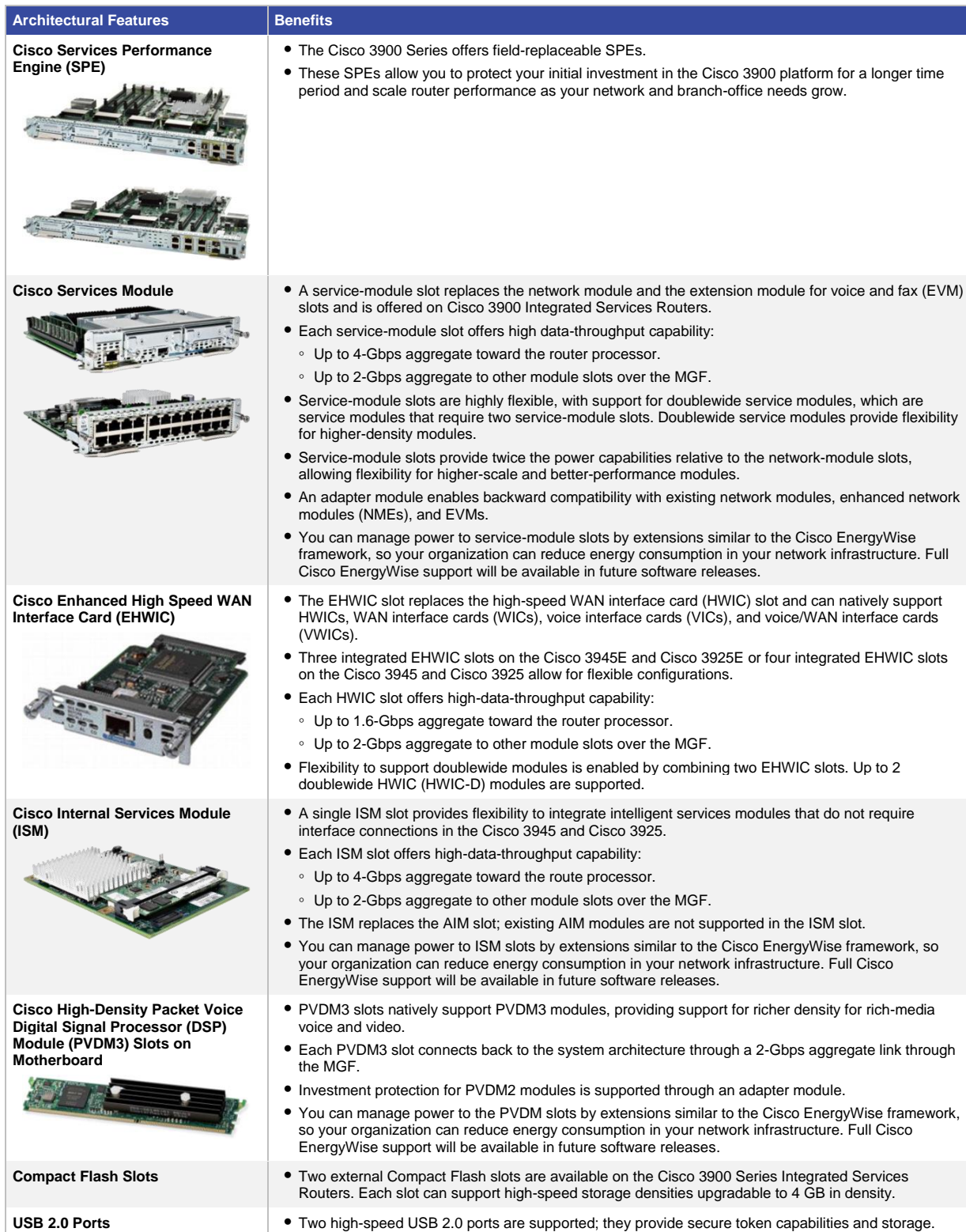
Table 3. Modularity Features and Benefits