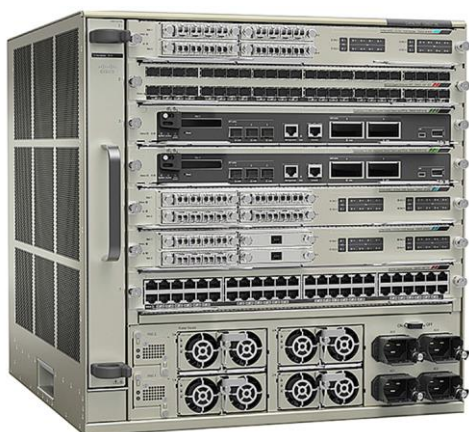
Figure 1. Cisco Catalyst 6807-XL Chassis

The Cisco Catalyst 6807-XL chassis offers integrated resiliency by providing 1+1 supervisor engine redundancy, redundant fans, and N+1 power supply redundancy, thereby limiting network downtime and making sure of workforce productivity, customer satisfaction, and profitability.